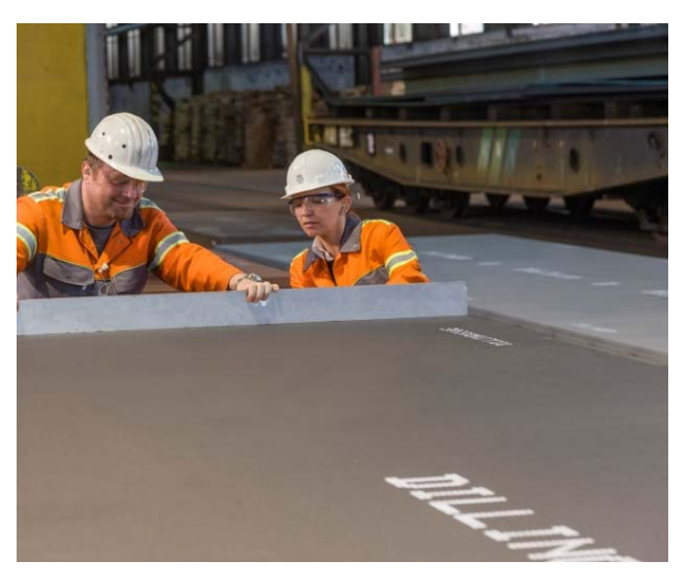
Figure 1-2: Starting right now, Dillinger can supply its ultra-high-strength DILLIMAX-brand steels in even greater thicknesses and with further enhanced properties.