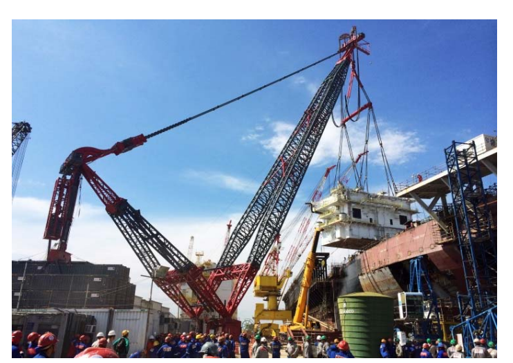
Figure 5: With a maximum boom height of almost 200 metres, load of 4,300 tonnes and a load moment of 196.000 tonne-metres, ALE's AL.SK190 became the world's largest capacity land-based crane.