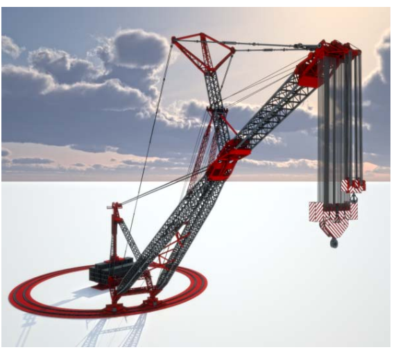
Figure 6: The fixed jib consisting of ultra-high-strength DILLIMAX steel serves as an extension of the boom and can, with its length of up to 100 metres, lift a maximum of 3,400 tonnes.