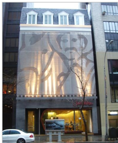
Picture 4 - 5: Smaller etching-projects have been realised by GKD in the USA before.