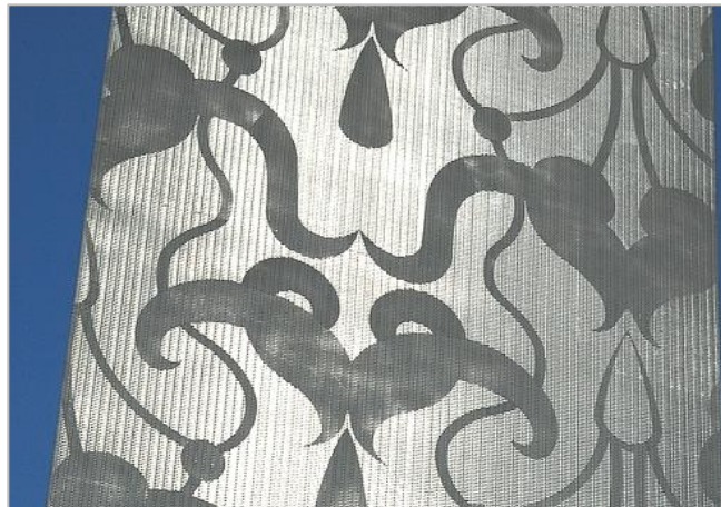
Picture 2: By means of a special etching technique the mesh was decorated with ornaments.