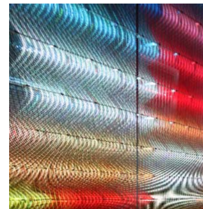
Picture 7: The three-dimensional effect comes from the light being projected onto the round stainless steel wires.

We will be happy to send you the desired images in printable resolution by e-mail.