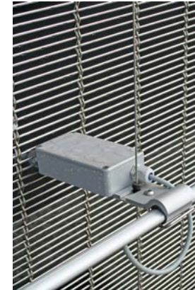
Pictures 2-4: The LED profiles are mounted at customized intervals in front of the mesh and supplied with power and image data by cables concealed behind the mesh.