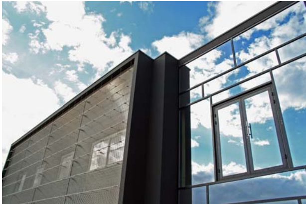
Picture 1: During the day, the transparent metal mesh façade (left) shimmers in the sunlight.