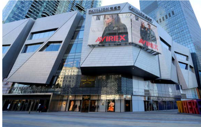
Picture 2: Transparent media façade as a corporate architecture element for global fashion companies.

Picture 1, 4 © GKD/Holtkötter Picture 2 © GKD Picture 3 © GKD/Rudi Böhmer