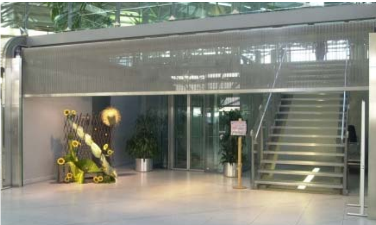
Picture 3: Despite its delicate appearance, the stable roller door system made of metal mesh prevents unwanted access and theft.