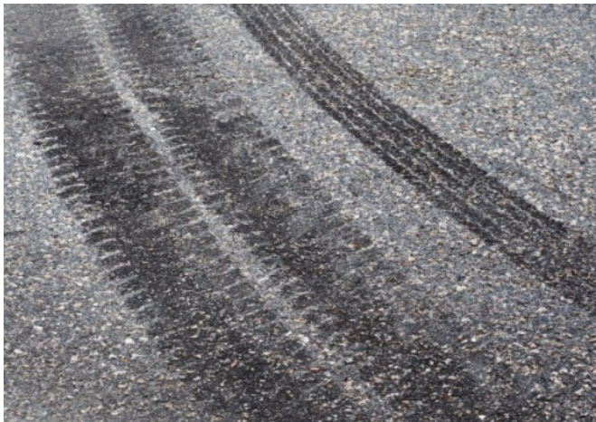
Picture 7: According to the German Federal Environmental Agency up to 111,000 tonnes of tire abrasion materials are produced each year in Germany alone.