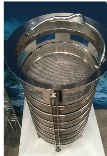
Picture 3-4: GKD developed a sampling basket with up to six filter elements and defined fractionation for sampling an entire rainfall event.

We will be happy to send you the desired images in printable resolution by e-mail.