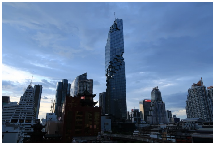
Picture 1: The German architect Ole Scheeren created Bangkok's new landmark in the form of the 314-meter high MahaNakhon.