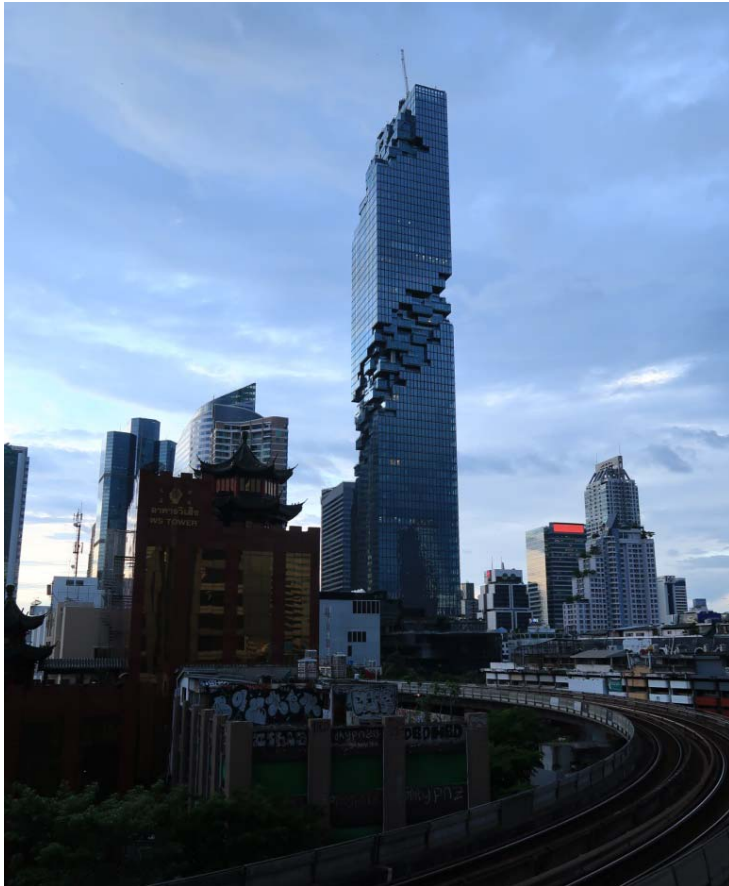
Picture 4: A parking tower rises behind the MahaNakhon, offering space for almost 900 cars over 10,400 square meters with an automated parking and retrieval system.