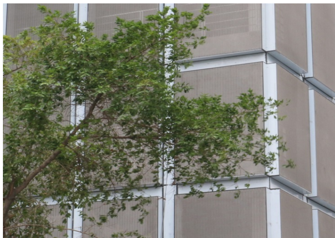
Picture 2: In order to adapt the parking tower's appearance to the luxurious overall ambience, the shimmering PC-Sambesi made of stainless steel mesh from GKD was chosen for the cladding.