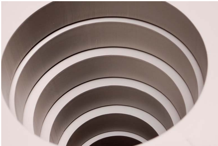
Picture 9: Jebens manufactured eleven different press-table inserts for the high-end press.

Such image material may be used solely for the JEBENS subject stated here. Any and all other uses, and use for non-JEBENS corporate purposes in particular, is hereby expressly prohibited.