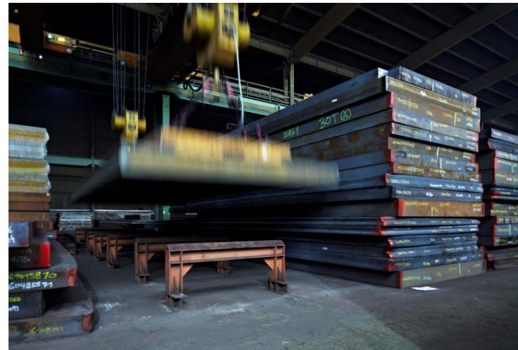
Picture 10: The availability of high-strength steels in their own stock - in thicknesses from 30 to 300 millimetres – spoke in favour of Jebens.